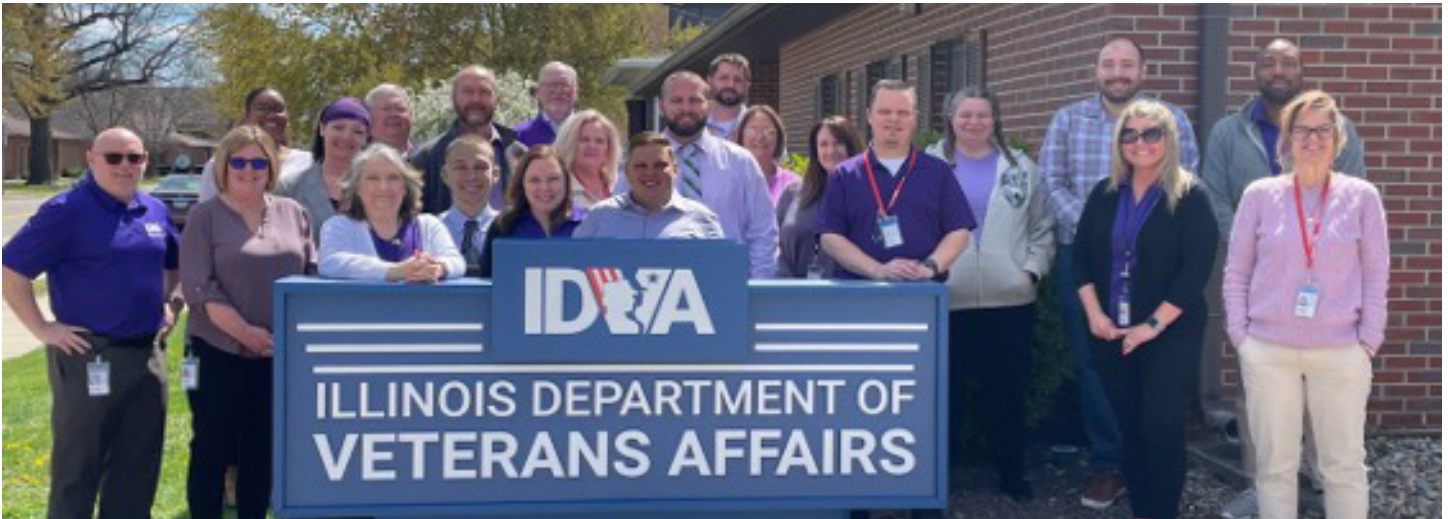
IDVA Central Office recognizes military children for their strength, resilience, and sacrifice by wearing purple on Purple Up Day, April 11, 2025. Purple is a blend of all the colors of the U.S. Military branches.

VSOs are accredited by the US Department of Veterans Affairs (USDVA). They assist veterans and their dependents in filing claims for benefits with state and federal agencies. This assistance includes applications to the USDVA for compensation, pension, and increased disability benefits. Additionally, VSOs assist in applying for admission to the Illinois Veterans' Homes, state and federal education, burial benefits, and federal health benefits. IDVA's accredited Appeals VSOs coordinate directly with the USDVA's Veterans' Benefits Administration to present and represent claims, assist veterans in appealing decisions, and appear at hearings with the claimants before administrative law judges.