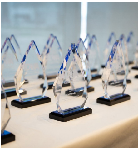
The 25 Women Veterans Leaders of 2025 were presented with an engraved award recognizing their contributions to the women veteran community.

In honor of Women Veterans Recognition Month, IDVA and the Jesse Brown VA Women's Health Program hosted the 25 Illinois Women Veteran Leaders of 2025. The award was presented to 25 outstanding Illinois Women Veterans in recognition of their exceptional leadership and community service across the state of Illinois. The event aimed to celebrate and highlight the invaluable contributions of Illinois Women Veterans, fostering a sense of pride and unity within the state. It also provided an important platform for Women Veterans to meet, network, and connect with one another, creating lasting relationships with other female leaders throughout Illinois. The ceremony underscores the commitment of the Illinois Department of Veterans Affairs Women Veterans Program to both their communities and the state, reinforcing the strong bond among these leaders. For more information on this supportive community, visit: https://veterans.illinois.gov/programs/women.html