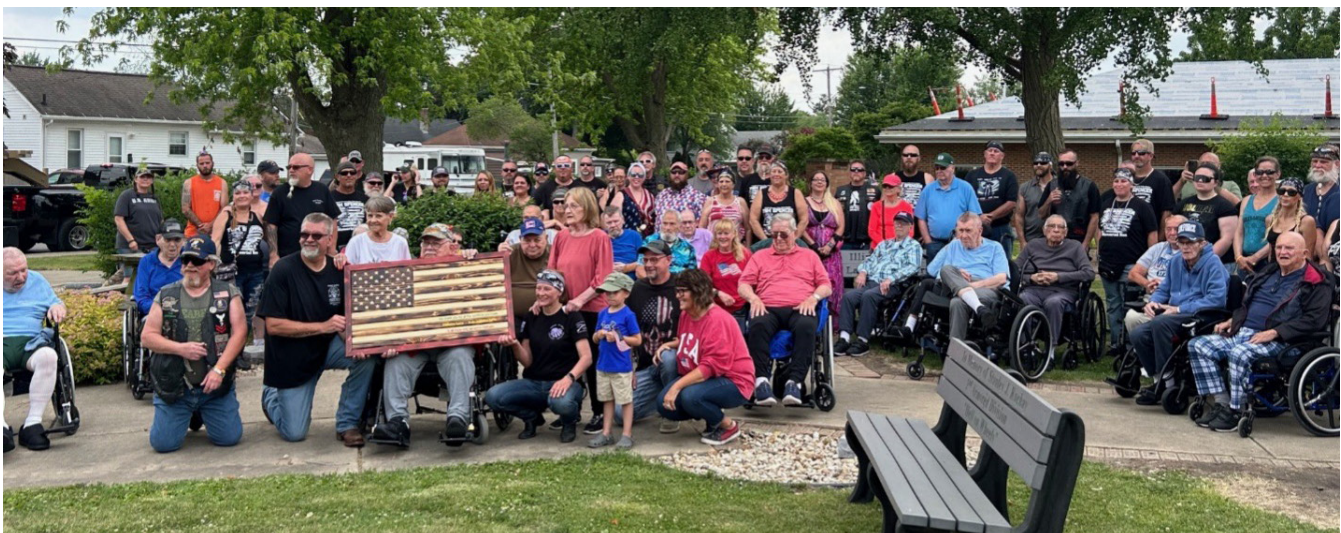
The Veterans' Home at LaSalle unveiled a Vietnam Veterans Memorial in its Peace Garden, accompanied by a motorcycle drive-by of local veterans.