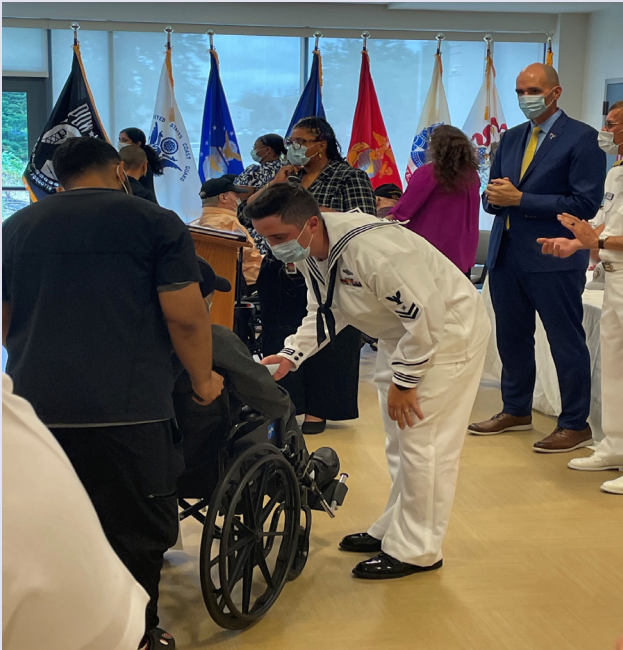
Sailors present U.S. Navy veterans with a Vietnam War pin as part of the Vietnam War Commemoration Ceremony.