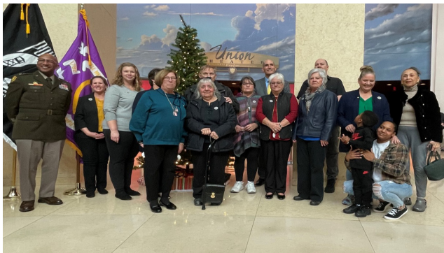
Gold Star Families participate in the Christmas Tree Lighting.