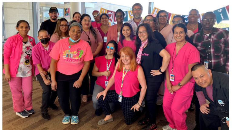
Team Veterans' Home at Chicago wears their pink well!

In honor of the millions of women who have been diagnosed with breast cancer, IDVA staff participated in a department-wide "Pink Out Day" to show support for the women who have or are actively battling breast cancer and the survivors.