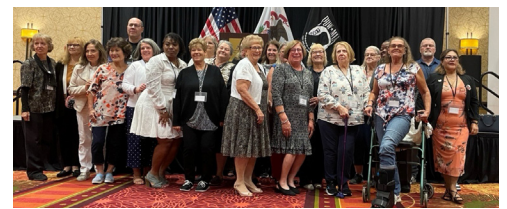
Gold Star Families gather at Gold Star Families Weekend in Bloomington.

Gold Star Families Day is held the last weekend in September and culminates with the Yellow Rose Ceremony on National Gold Star Mother's Day. In FY25, the families gathered in Bloomington for two days of programs, events, and gatherings. The families shared stories and honored their hero through tears and laughter.