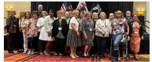
Gold Star Families gather at Gold Star Families Weekend in Bloomington.

Gold Star Families Day is held the last weekend in September and culminates with the Yellow Rose Ceremony on National Gold Star Mother's Day. In FY25, the families gathered in Bloomington for two days of programs, events, and gatherings. The families shared stories and honored their hero through tears and laughter.